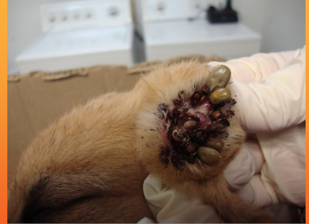
PHOTO: Kendra Wapaha, NNPAP Dog from Whippoorwill, AZ (Navajo Nation)

** Eight month Seresto Tick Collars available at our animal shelters **