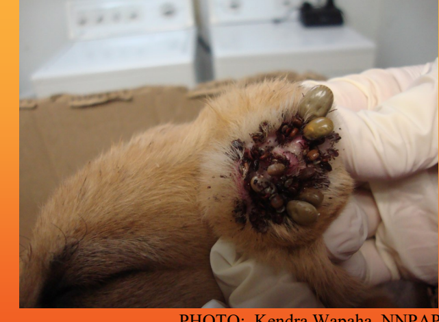
PHOTO: Kendra Wapaha, NNPAP Dog from Whippoorwill, AZ (Navajo Nation)

** Each 1st & 3rd TUESDAY of the month 8:00am - 5:00pm ONLY at each NN Shelter**