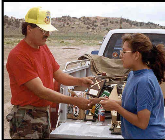
Hunter Education promotes safe gun handling and shooting sports