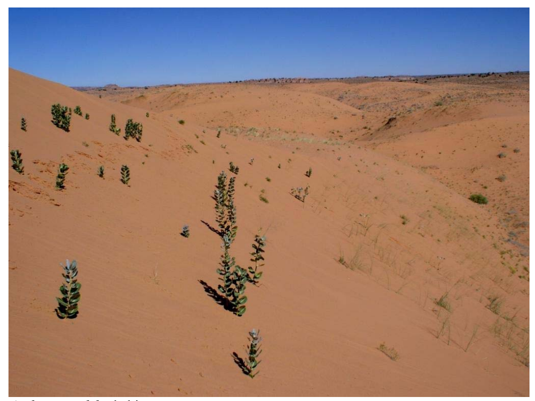
Asclepias welshii habitat