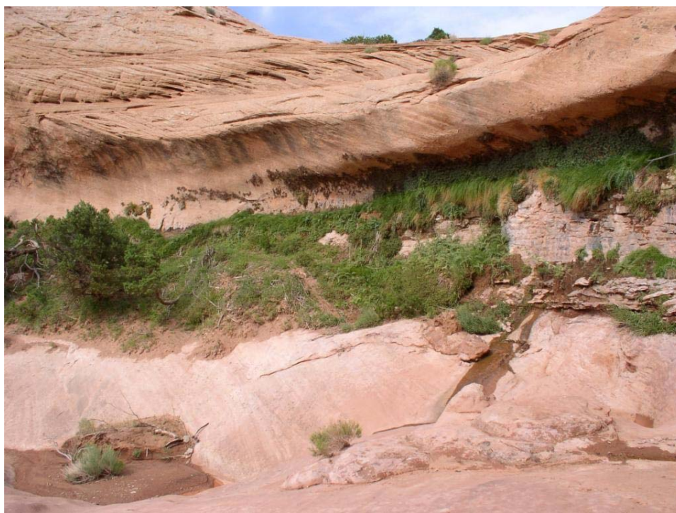
Zigadenus vaginatus habitat